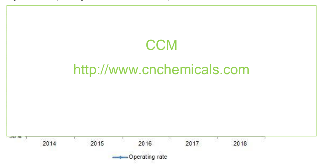
Figure 2.1-2 Operating rate of sodium chlorate production in China, 2014–2018