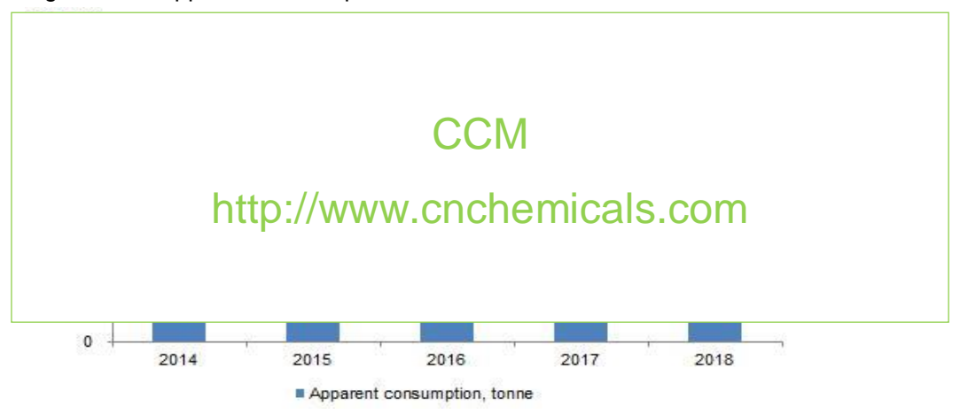
Figure 3.1-1 Apparent consumption of sodium chlorate in China, 2014–2018