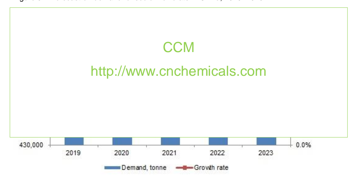
Figure 5-1 Forecast on demand for sodium chlorate in China, 2019–2023